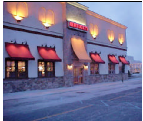
Bertucci's, Cherry Hill, NJ

Bertucci's recently opened its newest location at the Cherry Hill Mall in Cherry Hill, NJ. The existing space was formerly a Woolworth's. The Italian eatery occupies approximately 7,200 s.f. and seats 230 patrons. The existing storefront was removed and a new façade design, recalling elements such as the cultured stone base and brick veneer tower was built. M.D.A. worked closely with Bertucci's in-house designer, construction team, permit expediter, and contractor, Fortunato Construction Group, to achieve the desired results.